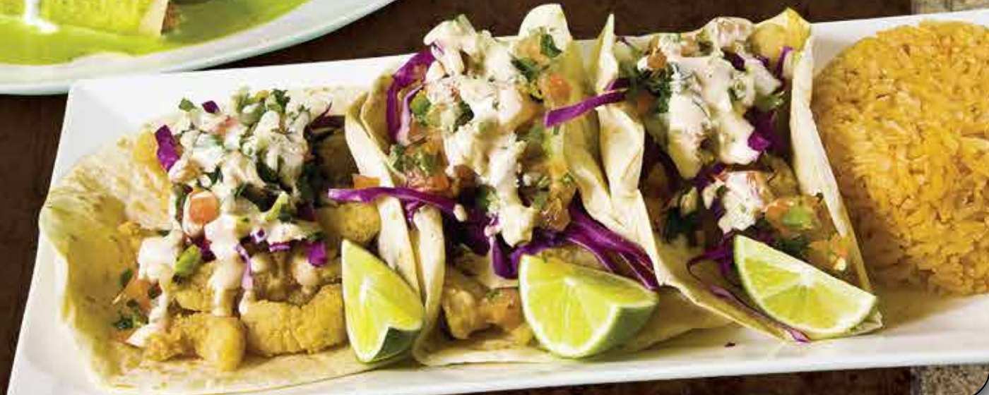
TACOS DE PESCADO LA PAZ