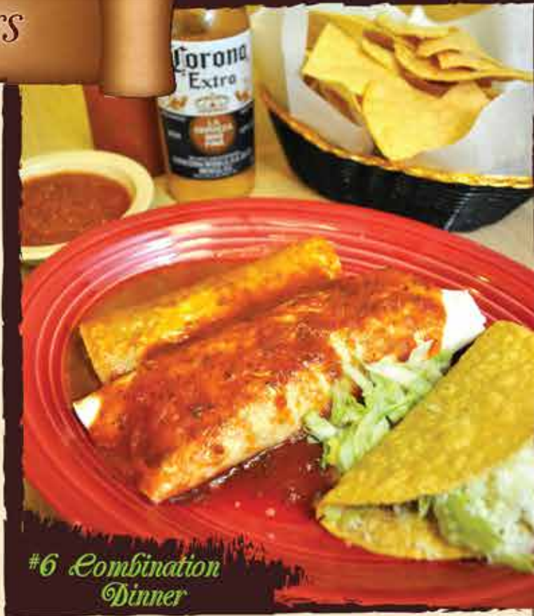
#6 Combination Dinner