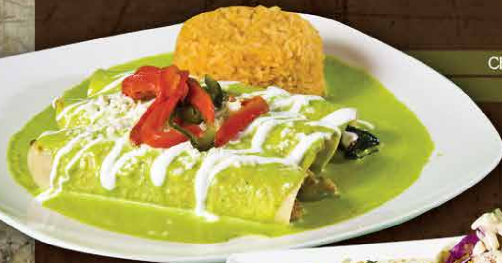
CHICKEN & SPINACH ENCHILADAS