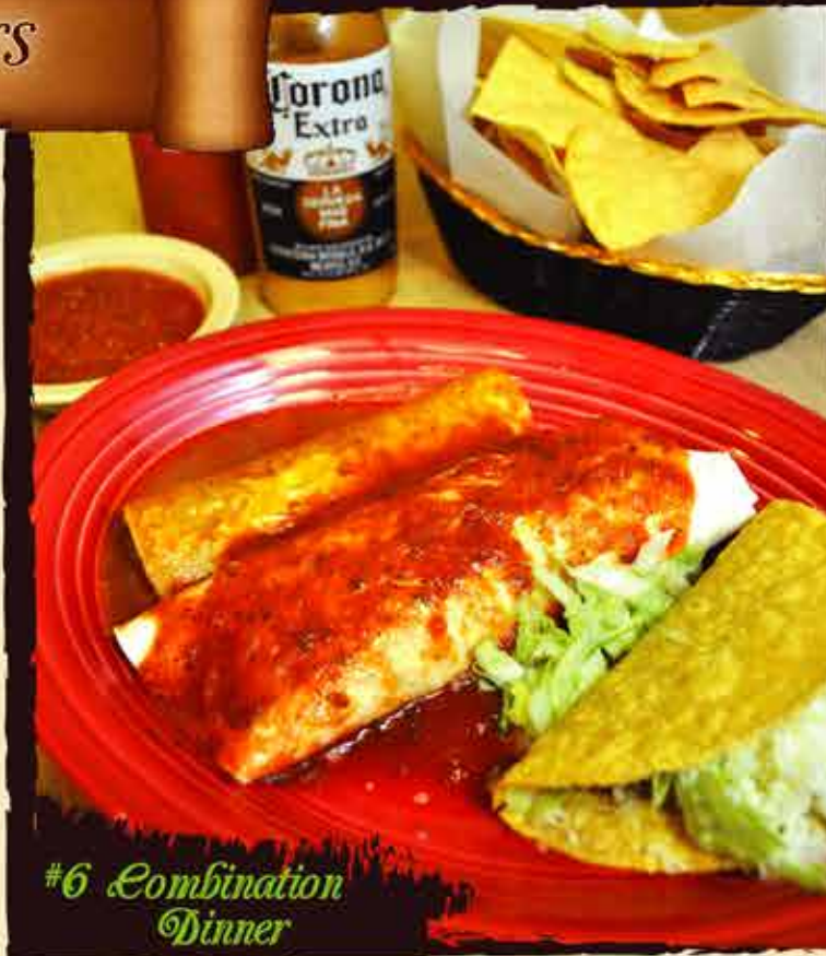
#6 Combination Dinner