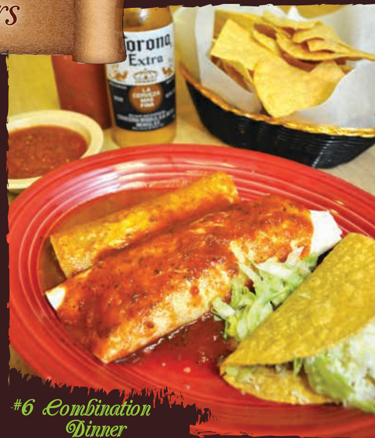
#6 Combination Dinner